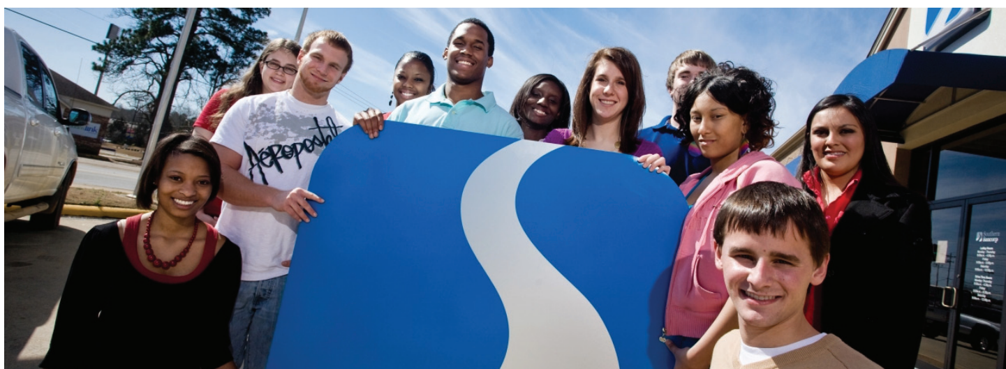
Southern Bancorp's 2009 Student Advisory Board - Arkadelphia, Arkansas.