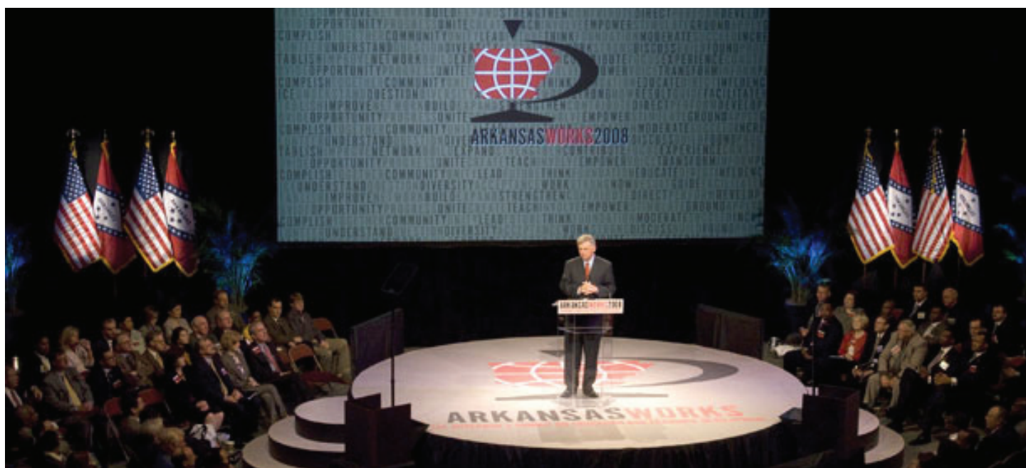
2008 Arkansas Governor's Summit for Education and Economic Development

More than 1,400 representatives from all 75 counties in Arkansas met at the Arkansas Governor's Summit for Education and Economic Development to begin developing strategic visions for their communities. Speaking before the assembled leaders, Governor Mike Beebe recognized Southern Bancorp's strategic planning efforts in Phillips and Clark Counties and encouraged and advocated the process to other communities across the state of Arkansas. In this and other ways, Southern's approach is becoming a model for community change initiatives in the state and the region.