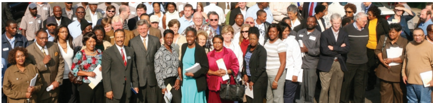
Phillips County Strategic Plan Launch Event

Southern Bancorp has continued its targeted development work in Phillips and Clark Counties, Arkansas, and in Sunflower County, Mississippi. Our approach is focused on the fundamentals of economic development: educational improvement and the development of strong local leadership.