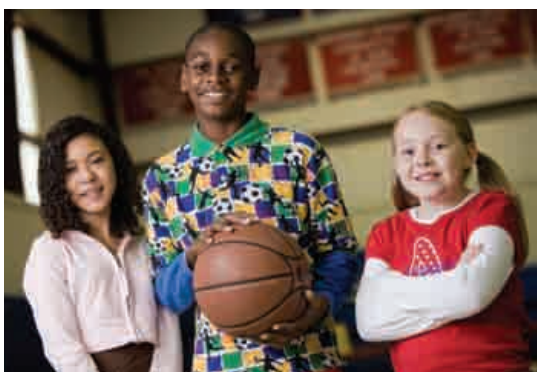
Youth of Clark County, Arkansas

Since the Delta Bridge Project was launched in Phillips County, Arkansas, in 2005, Southern has leveraged investments exceeding $70 million. Over 1,000 people have seen their lives dramatically improved (e.g., 350 at-risk youths are climbing the mountain to college). By working with communities in its target market, Southern is able to make results-driven strategic investments. Over the next 20 years, Southern expects to achieve three transformational goals in Phillips County: reduce the unemployment rate by 50 percent; reduce the poverty rate by 50 percent; and increase high school graduation by 50 percent. While these goals are ambitious, Southern and the community are confident they can be achieved.