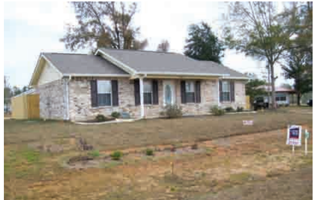
New home financed by Southern Bancorp in Hancock County, MS.

In hurricane-damaged Hancock County, Mississippi, Southern Bancorp financed a new housing subdivision to provide homes for 70 displaced families. This effort is in partnership with Habitat for Humanity and comes at a time when 15,000 people in the area are planning to move from FEMA trailers and will need affordable, safe, and permanent housing.